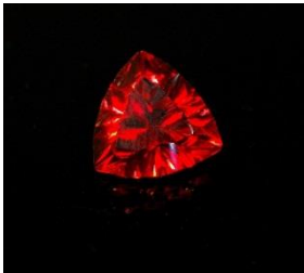
NEW DESIGN 1 st gem! Exceptional Brilliance. “Three Alarm Fire”

Concave cut trilliant. 8.5 mm 1.89 ct BRLF 0419-1 $397 I named this one for three things: Head over heels Romance, Desire, and Soulmate.