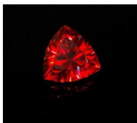
NEW DESIGN 1 st gem! Exceptional Brilliance. "Three Alarm Fire"

Concave cut trilliant. 8.5 mm 1.89 ct BRLF 0419-1 $397 I named this one for three things: Head over heels Romance, Desire, and Soulmate. SOLD