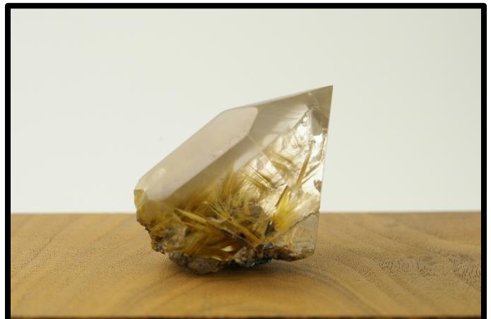
Quartz Crystal Rutilated Phantom, Brazil. $129

Brazil. Golden rutile and phantom growth. Natural base showing rutile with hand polished faces. Gem carving grade – exceptionally clean. Approx. 40 x 55 x 30 mm. 435 carats.