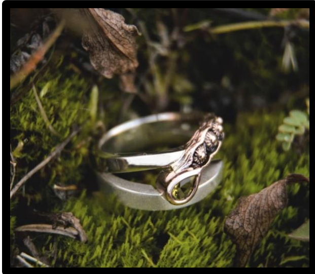
Beautiful engagement ring featuring a pear shape ET peridot. Client in Alberta, Canada

Extraterrestrial Peridot Gems and Jewelry created by our customers.