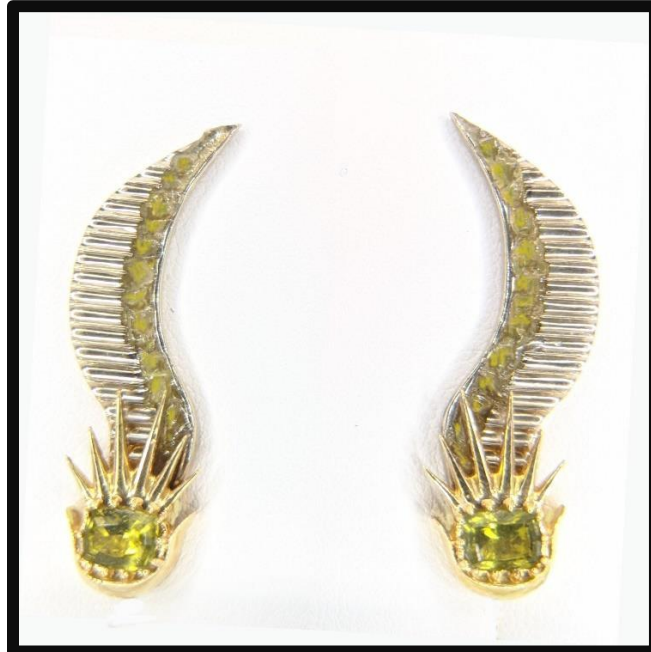
ET peridot cushions in stunning earrings. Wonderful meteor design with small rough accents. N.N., California

Extraterrestrial Peridot Jewelry created by our customers.