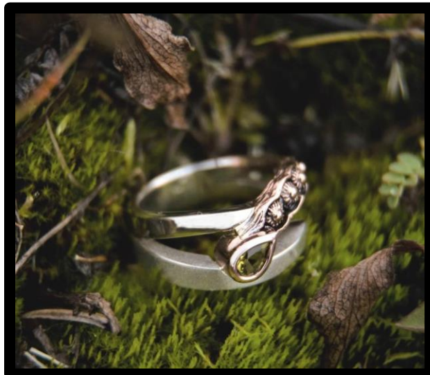
Beautiful engagement ring featuring a pear shape ET peridot. Client in Alberta, Canada