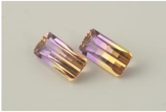
Bar Cut matched pair 13.5x6mm total weight 6.71ct QAMF0112-8 Price $169