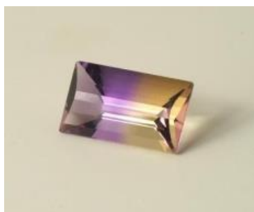
Cross Reflector Cut. 13.2 x 7.8mm weight 4.20 ct QAMF0913-23 Price $109