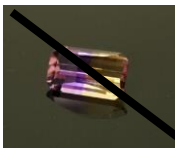
Opposed Bar Cut. 4.25 x 8.53mm weight 5.72 ct QAMF0913-15 Price $149

Our faceted stock has Sold Out. Rough is available for custom cuts.