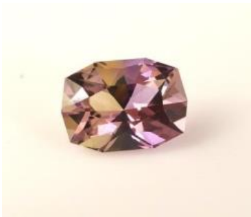
Cushion (Brilliant) 13 x 9.4mm weight 4.84 ct QAMF0913-11