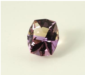
Cushion (Atlas) 12.4 x 10.4mm weight 4.93ct QAMF0913-9