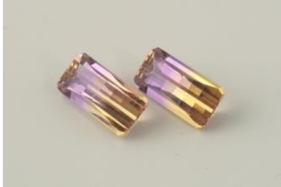
Bar Cut matched pair 13.5x6mm total weight 6.71ct QAMF0112-8