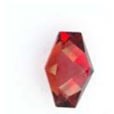
Diamond Back Cut