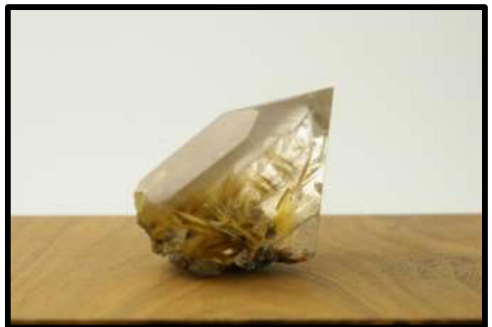
Quartz Crystal Rutilated Phantom, Brazil. $129

Brazil. Golden rutile and phantom growth. Natural base showing rutile with hand polished faces. Gem carving grade – exceptionally clean. Approx. 40 x 55 x 30 mm. 435 carats.