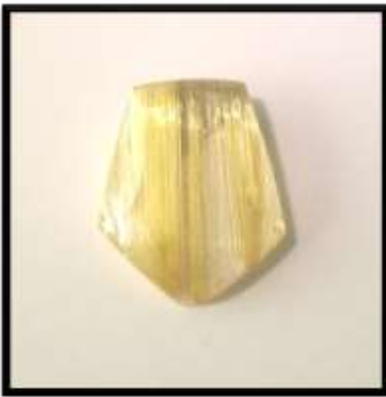
Rutilated Quartz Cabochon $85

Click on Back Arrow at top of page to return to main page.