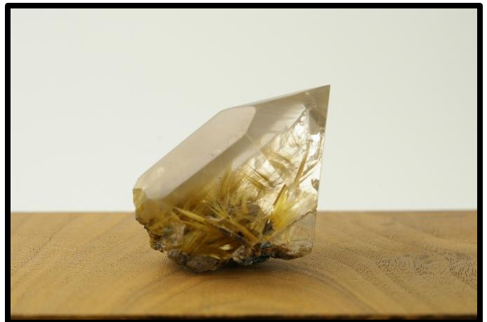
Quartz Crystal Rutilated Phantom, Brazil. $129

Brazil. Golden rutile and phantom growth. Natural base showing rutile with hand polished faces. Gem carving grade – exceptionally clean. Approx. 40 x 55 x 30 mm. 435 carats.