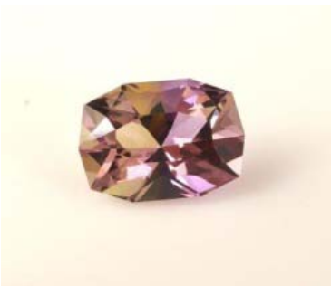
Cushion (Brilliant) 13 x 9.4mm weight 4.84 ct QAMF0913-11