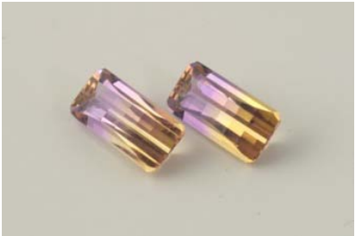
Bar Cut matched pair 13.5x6mm total weight 6.71ct QAMF0112-8