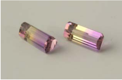
Bar Cut matched pair 11.9x4.85mm total weight 4.76ct QAMF0112-9