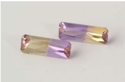
Scissor matched pair 13x4.7mm total weight 3.92ct QAMF0112-10